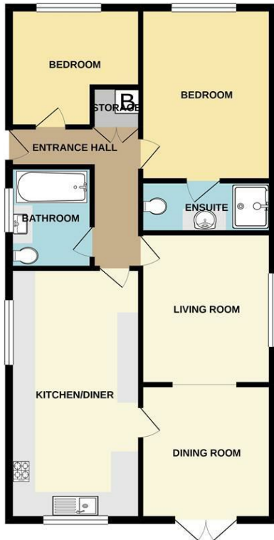
GROUND FLOOR 774 sq.ft. (71.9 sq.m.) approx.